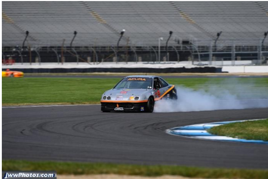
at the 2021 SCCA Runoffs at IMS

Reminder: January 16 th is the Indy Region Annual Banquet and the 75 th Anniversary Celebration. Looking forward to seeing everyone at the event.